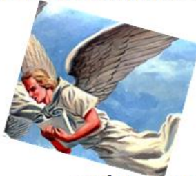
2 nd Angel followed

We are going to examine this scripture to analyse this second angel’s message using the study questions on page 1.