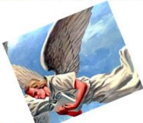
1 st Angel

“And there followed another angel, saying, Babylon is fallen, is fallen, that great city, because she made all nations drink of the wine of the wrath of her fornication.”